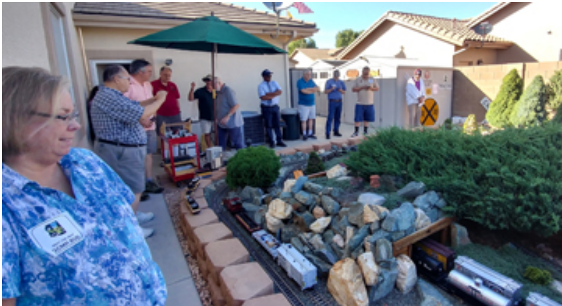
Walt Bouman's G Gauge backyard layout