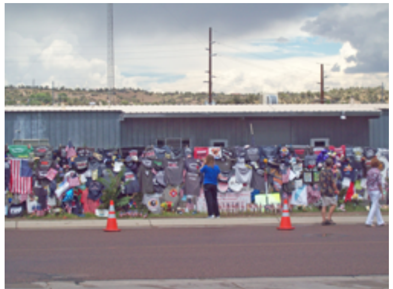
The first stop was at the spontaneous memorial in Prescott that memorializes the nineteen fallen Yarnell Hill firefighters