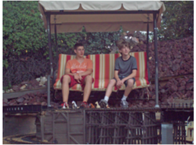
Stan even provides comfortable viewing areas. Of course you have to climb to get to it.