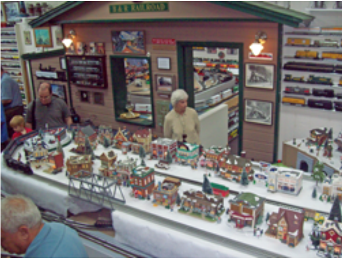
An addition this year was a Christmas layout featuring the Polar Express and several animations