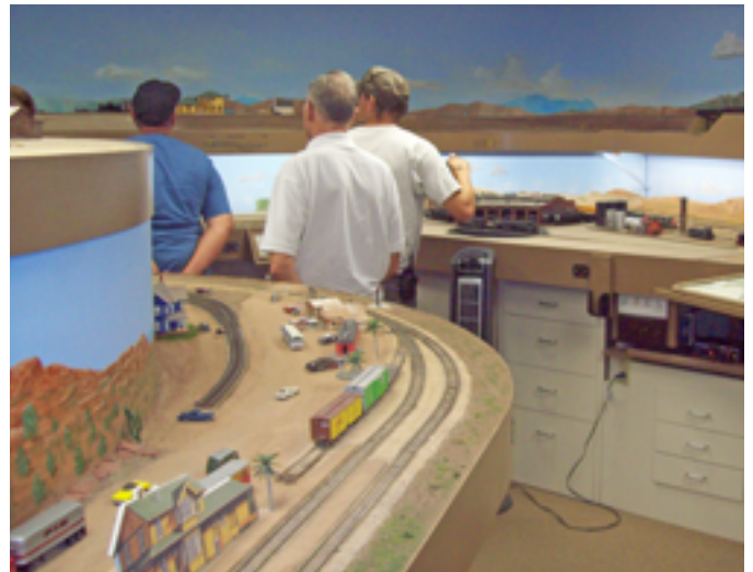
The group's next stop was at the HO layout of Donn Pease. Donn is modeling the Southern Pacific east of Tucson. He has a wonderful backdrop in and many future buildings are shown by photos as can be seen on the bottom left of this shot.