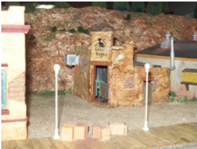
The Black Cat saloon is the main watering hole at the new town of Red Lake on the Atonna's narrow gauge line.