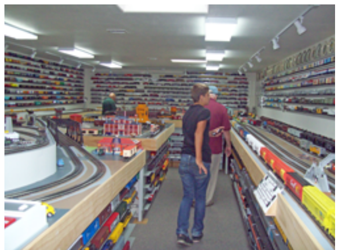
Then it was on to the traditional stop at Marlin Benson's with a train room full of long trains running and shelves full of trains