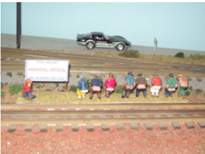
Amtrak mooners may move around, but are never gone from the Seligman and Paulden Lines