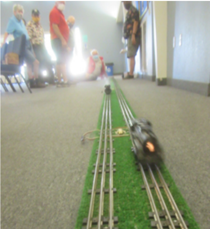
DAVE'S "FLASH" TO THE FINISH LINE!