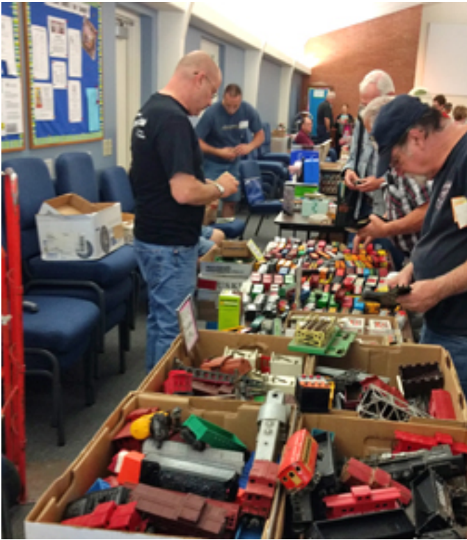
The folks did come!