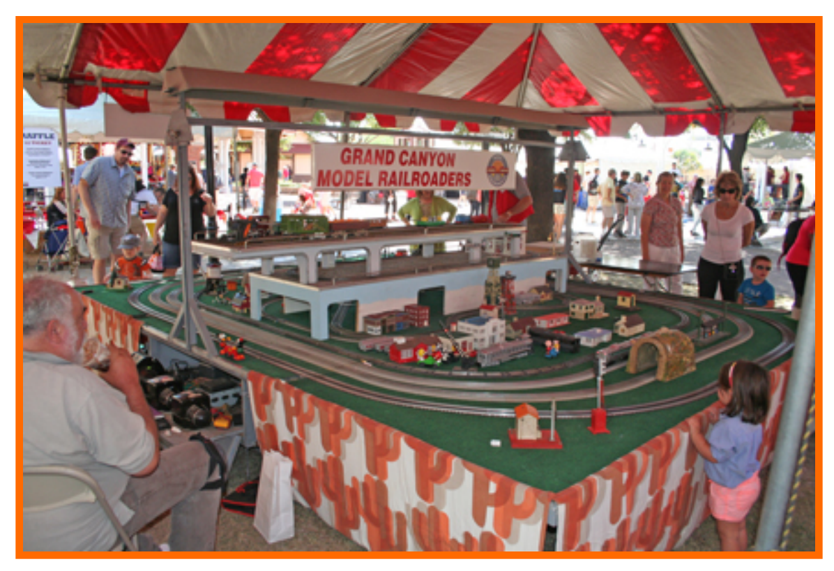
The GCMR was in full presence during last weekend's Scottsdale Railfair. All three of the club's three layouts: the trailer and the O and S gauge modules - were set up and trains ran all weekend. Nothing brings families and kids like the sound and sight of toy trains running. And it worked, as much as any other display at the park, there were always kids and families enjoying the GCMR's show.