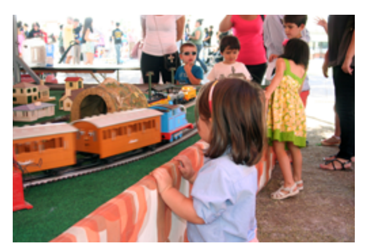
The GCMR layout always attracted kids

Here are some of my photos from the day: