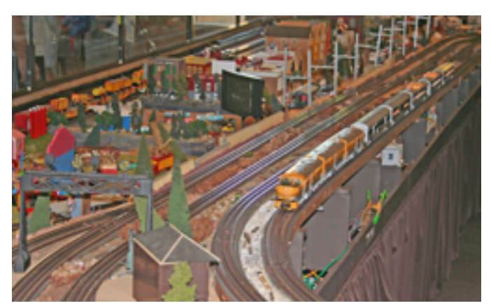
The P&P layout