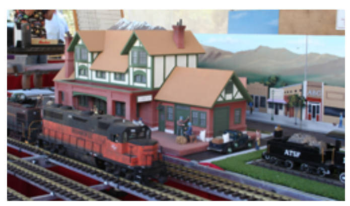
Flagstaff on the ABTO modules