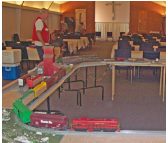
The O gauge modular layout was up and running