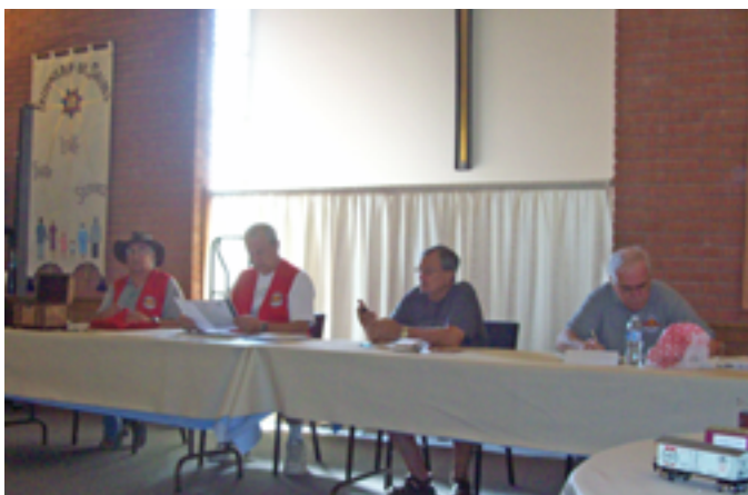
The head table working hard