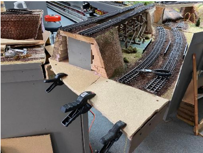
Adding the new "swing portion"