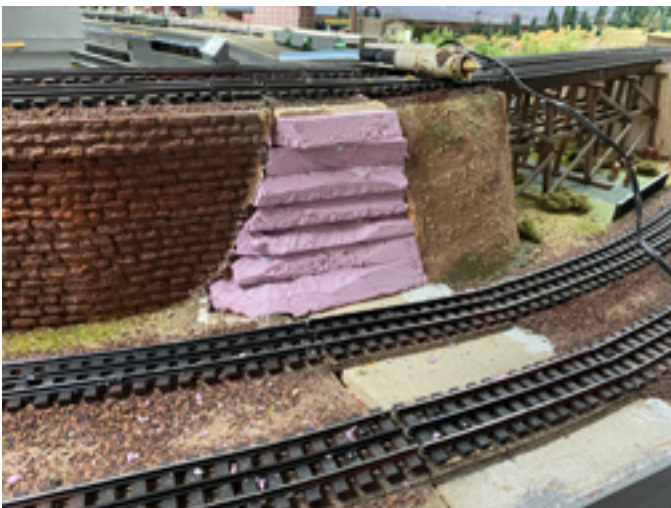
And landscaping. And it is done!