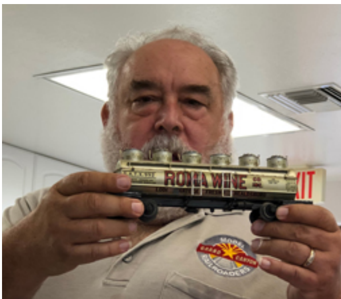
Waiting for show and tell!