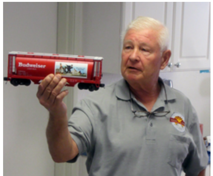
Herb with a Budweiser car