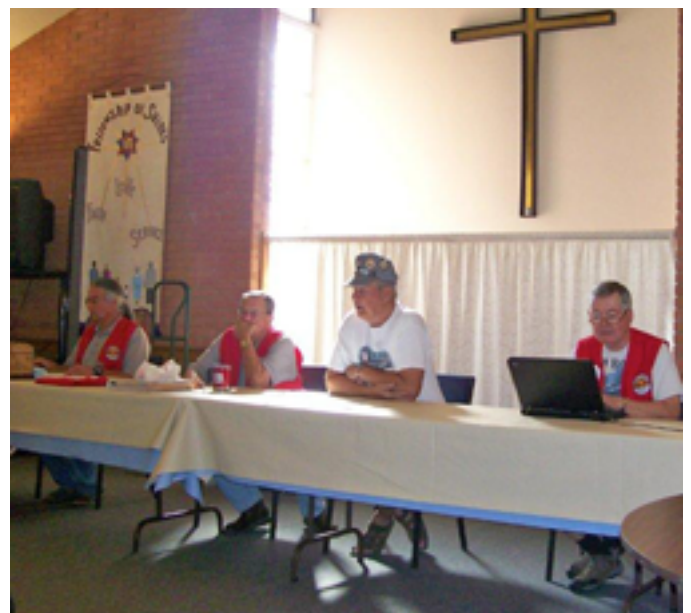
The Board is always at work!

The holiday display at Adobe will be the first three weekends in December. We'll have the mobile layout on display thus will need volunteers to operate it. The dates and times are: Nov 30 - Dec 1, Dec 7 - 8 and Dec 14 - 15. Times are 5:30-8 pm each day.