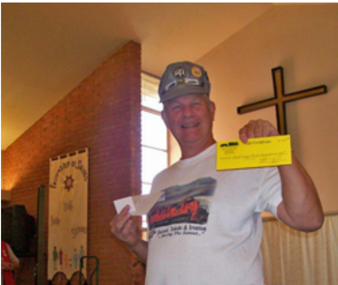
A very happy Grand Prize winner!