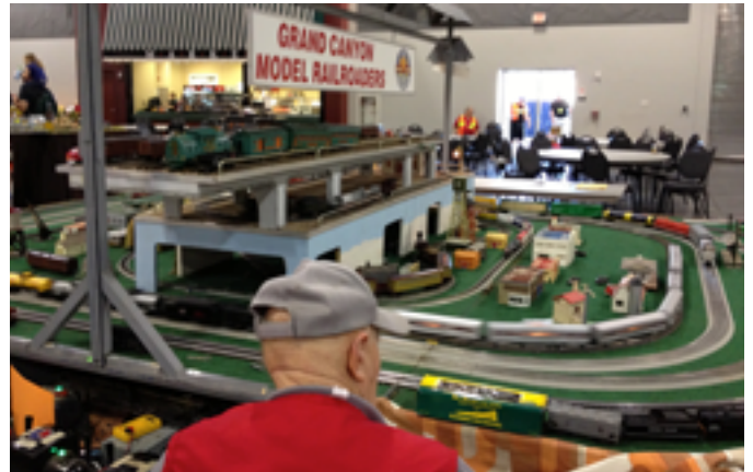
Our guys at work

The West Coast public got to enjoy the GCMR modular layout at Cal Stewart in its new venue at the Ontario Convention Center. One of the delights of Cal Stewart is the number of layouts by different groups on display. Here is a sampling.