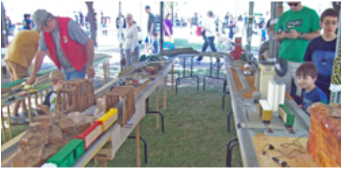
The modular layout