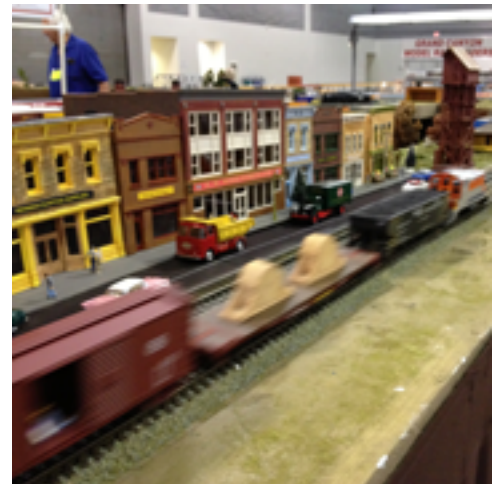
Southern California S Gaugers