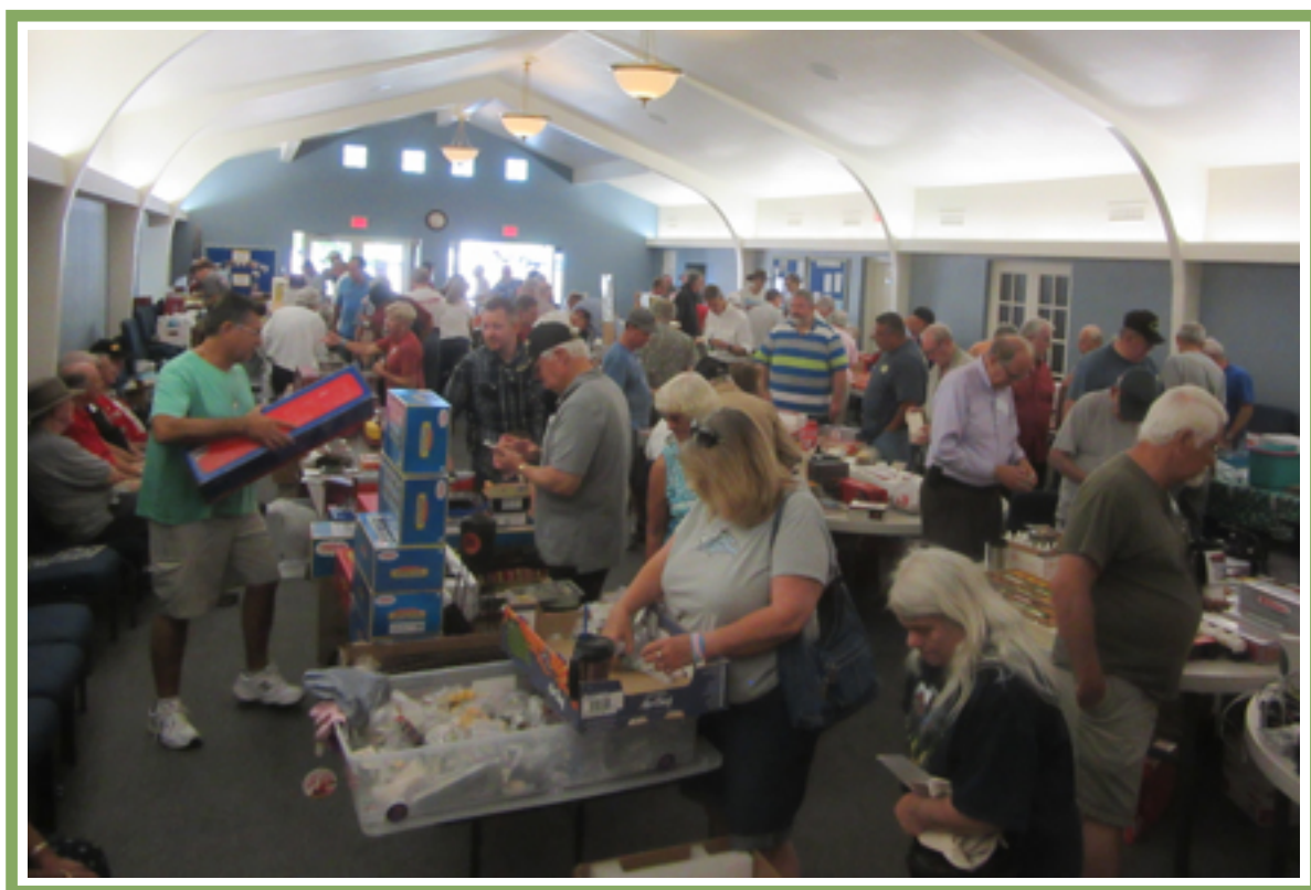
This spring's Mini Meet proved to be really popular!