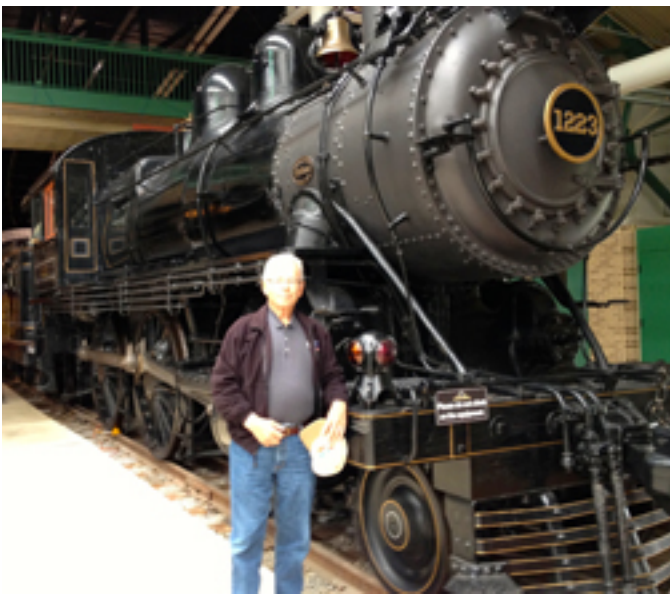
Peter in Heaven - RR Museum of Pennsylvania

by, including an Acela. At Washington Union Station, we went up to my favorite train watching spot on the upper garage level and again marveled at the world of high density passenger rail facilities. Then it was on to the Capitol Limited to Chicago - arriving four hours late due to really intense freight traffic in Pennsylvania and the Chicago area. But with a normal six hour layover and more normal outside Chicago weather (bad), it made the wait inside Union Station much shorter. Finally, we boarded the Southwest Chief and an evening and a day later we made an almost right on time arrival at Williams and home.