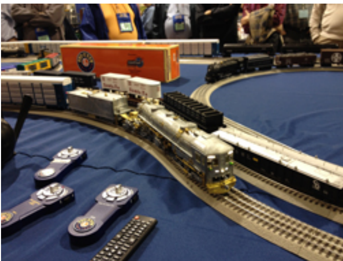
The not so exciting Lionel display layout. Nothing like the scenediced beauties of the past.