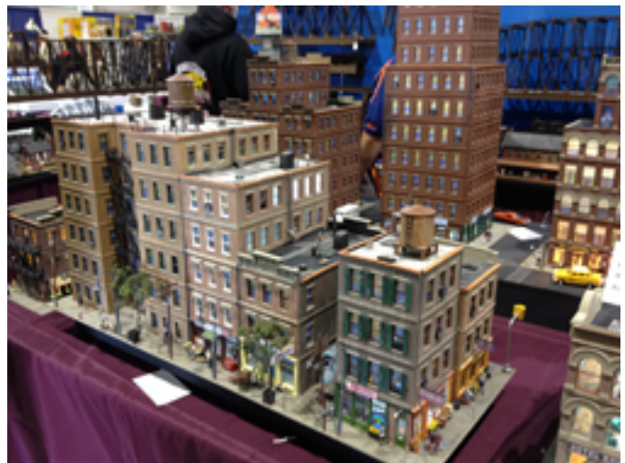
One of the custom builder's displays. There is some beautiful craftsmanship out there, if you are willing to pay the price. Personally, these just give me "ideas"