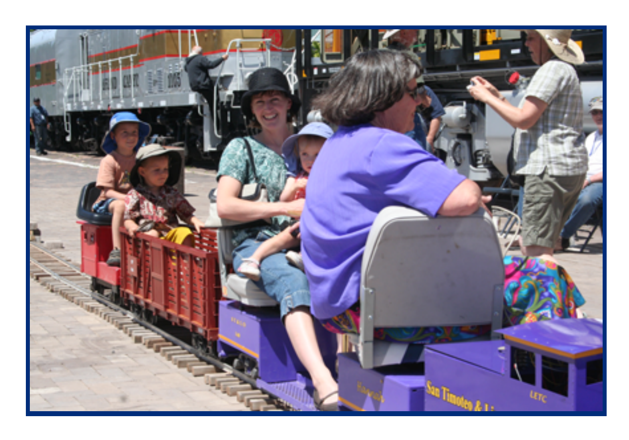
There was something for all ages at the 2012 National Train Day event in Williams over Mothers Day weekend, highlighted, of course, by the GCMR trailer layout.