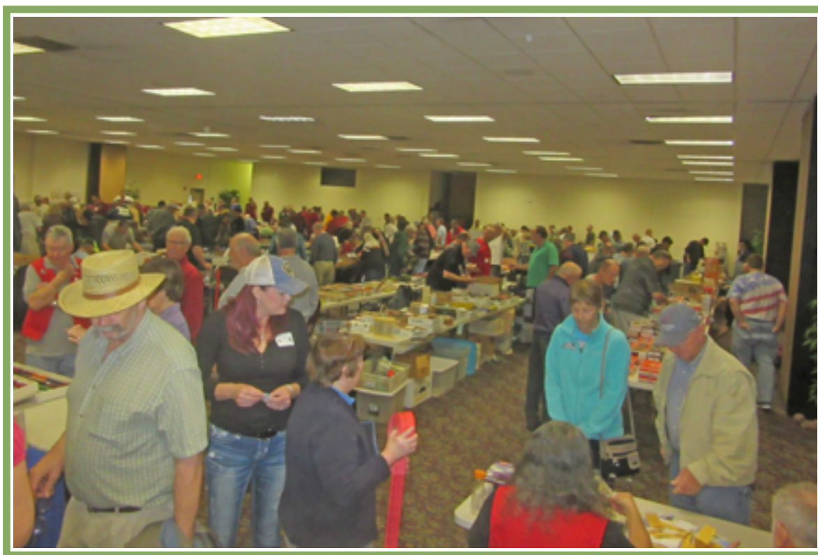
Looks like the Winter Cactus Meet was a Success!