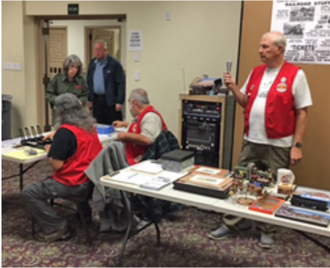
Working the Registration Desk

Lionel O-gauge Polar Express set (used) – J Eaton - $200 Loco sign/bell – J Eaton - $50 Railroad Wind Chime – J Eaton - $40 HO train set – G Saber - ? G-gauge train set – G Saber - ?