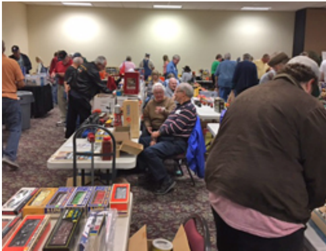
Goodies on the tables

Attendees can bring their own food and drink without restriction. We can rent their kitchen and bring someone in to prepare food or we can arrange for a food truck. We haven't decided what to do on this yet.