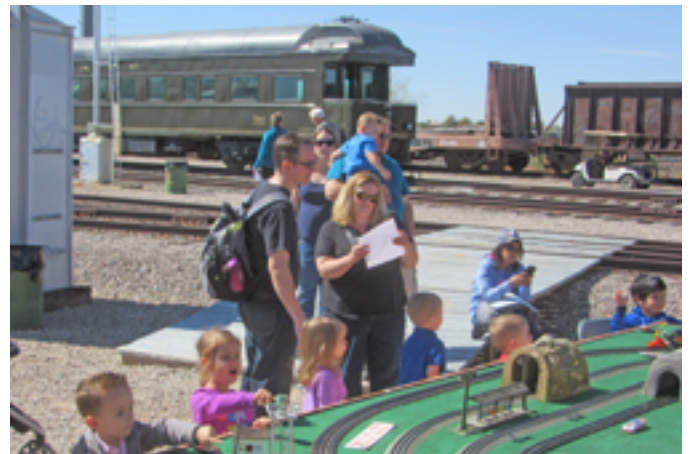
Toy trains and real trains: pretty good!

The next venue for the mobile layout will be Easter weekend when the P&P borrows it for use at the PV United Methodist Church.