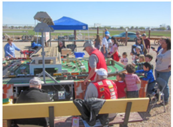
We drew a crowd!