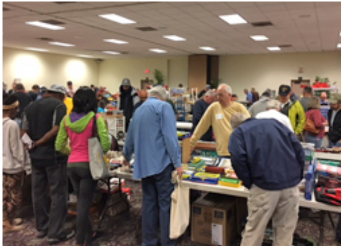
And lots of buyers!