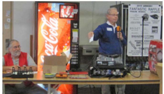
The end of meet auction made sure no seller had to take home any items he didn't want to!