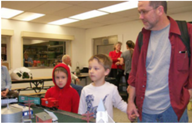
What it was all about