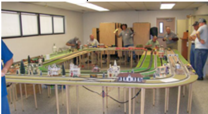
The S gauge modular layout in operation