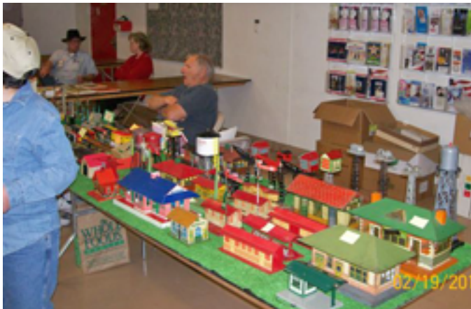
Tables full of goodies