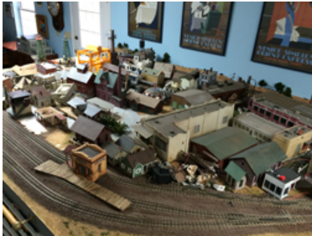
Buildings to be relocated in their "holding area"