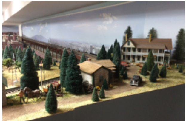
And, yes, there are still to be rural areas