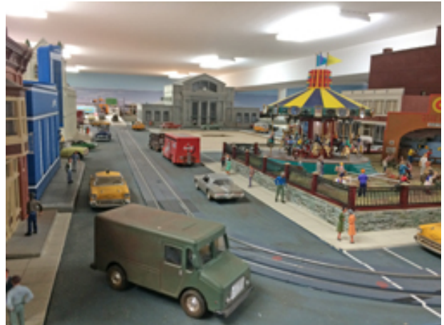
Downtown is filling up