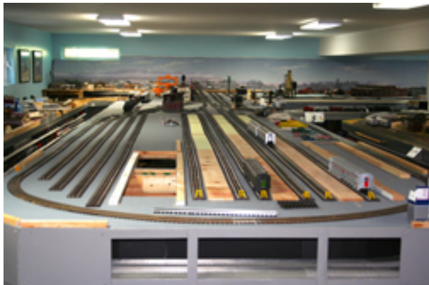
Subway is in as are the tracks to the station