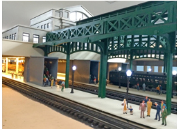
The station is now open and taking passengers

Deconstruction began the week following the Beat the Heat open house in 2014 and except for a GCMR bus visit last year to see the progress, it has not been open to the public till this year. I finally feel I have come far enough to hope folks will enjoy seeing where it is going. So, to whet your appetite for this year's bus tour, here is a short photo gallery of the changes.