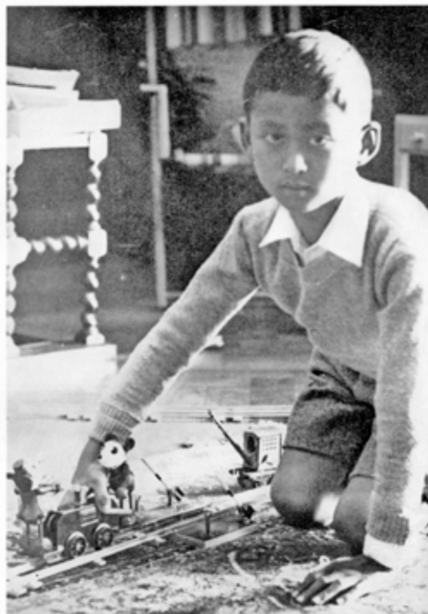
On his 10th birthday, King Ananda, boy ruler of Siam, posed for this photograph with his Lionel railroad and Lionel Mickey Mouse handcar.