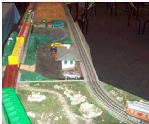
More of the O gauge modular layout

In the low water time of year, the two Canoeists struggling to avoid the rocks in Coyote Creek ignore the Westbound Empire Builder and a coal drag pulling into the yard. A scene on Rod Johnson's layout.