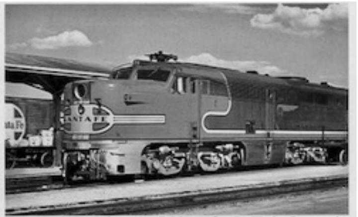
This engine, Alco PA #70 frequently pulled the train from Fort Worth to Brownwood. Here the engine sits in Fort Worth between runs.

Here is a photo from the current journal of the Santa Fe Historical Society. Guess what, the