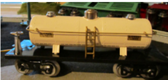
From the top left: #13 cattle car, #114 boxcar, #112 gondola, #116 ballast car, #115 tank car From the top right: #117 caboose, #38 electric, incorrect #400 tender, correct #400 tender