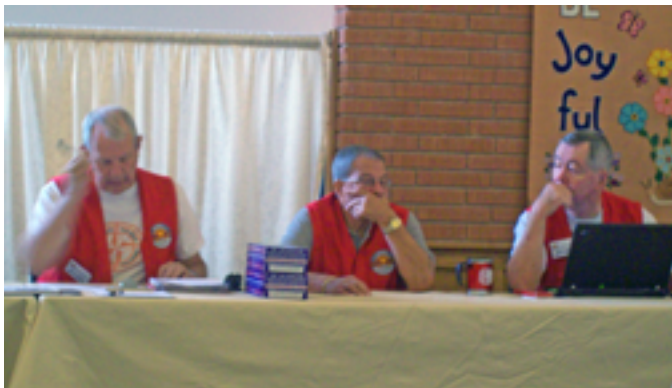
Your Board "at work"

One suggestion presented is for the club to plan outings beyond a toy train meeting that would tend to include significant others. Such outings could be local or out of town or potentially out of state. In simple terms, where would you like to go and/or what would you like to do? Please send me an e-mail ( jzdraftz@cox.net ) to let me know your thoughts.