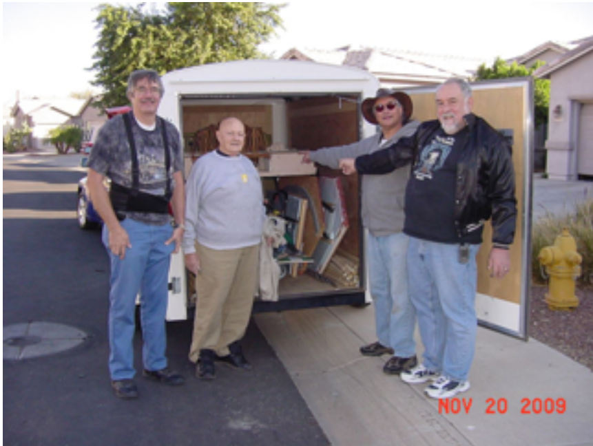
All packed and ready to hit the road to Pasadena

home.comcast.net/~tucsonntrak/ASWMRR/ASWMRR_Info_Overflow.html