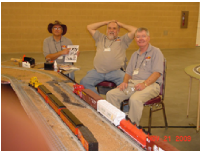
The O gauge gang asks, "is this work?"