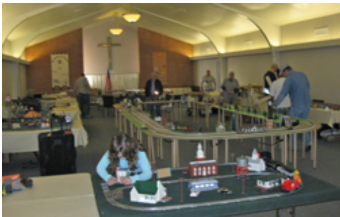
A hall full of displays at the GCMR December open house