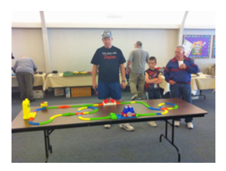
ADOBE MOUNTAIN SWAP MEET