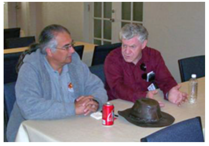
Our new pres and vice pres