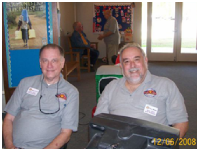
A couple of your friendly hosts

Thanks also go to each of the members who set up their trains, talked to the public, provided snacks for our visitors, answered questions, and in general enjoyed sharing the Christmas spirit with kids of all ages. It was truly rewarding to be able to share our hobby with others and see the joy that trains bring.