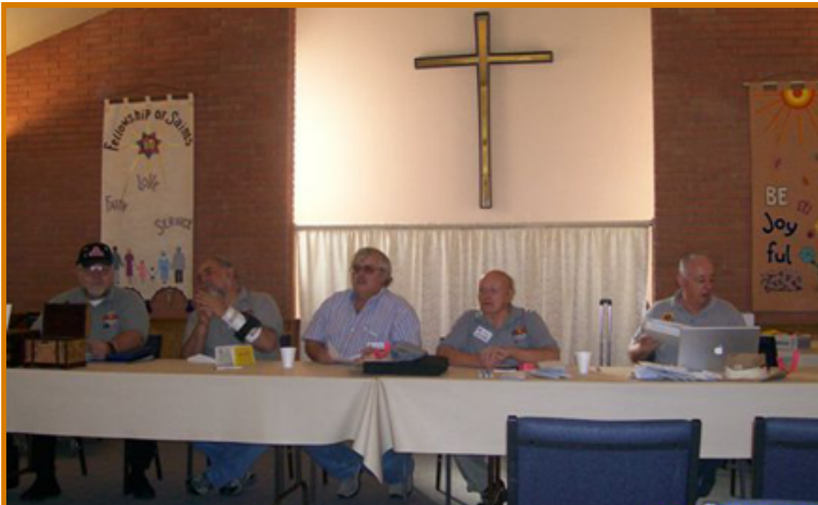
Here are your outgoing 2008 GCMR Officers who served us all well during the trying times of the past year.