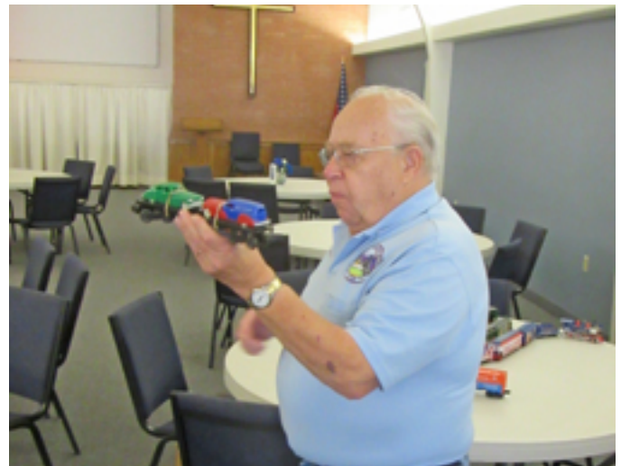
Ralph and the TCA flat car

The GCMR website www.gcmrr.org is ready . Please go check it out and tell us what you think of it.