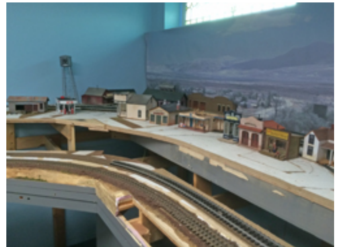
“New” Ash Fork

As most GCMR members know, last year I decided that I had accomplished all I could with my layout. So, rather than just enjoying it (!), I decided I wanted to try a totally new theme. I have long enjoyed big cities and railroads so wanted to try that with my layout. Demolition began after the Beat the Heat open house visits last August and continues to this day. But I am slowly making progress on the new version (working on hands and knees, under the layout with wire and a soldering gun dripping globs