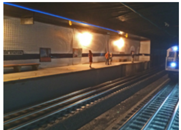
The subway stop at Union Station

The main terminal tracks and passenger yards. You can see the beginnings of the platforms. This area will become under downtown and Union Station.