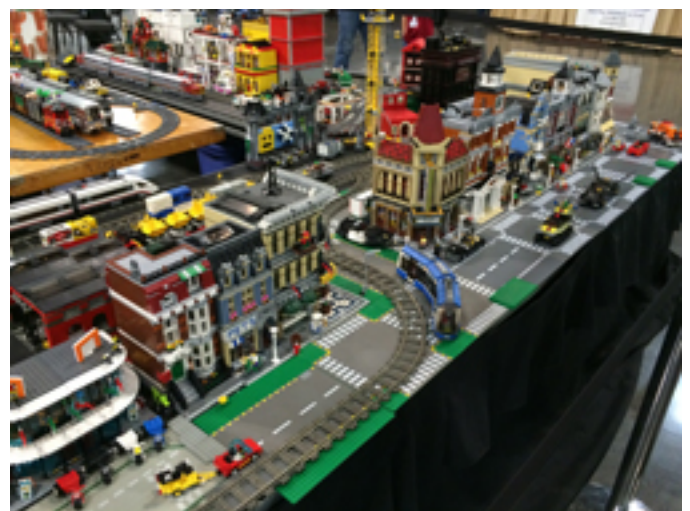
One of several delightful Lego layouts