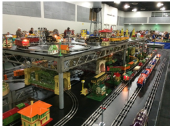
A spectacular Standard Gauge layout