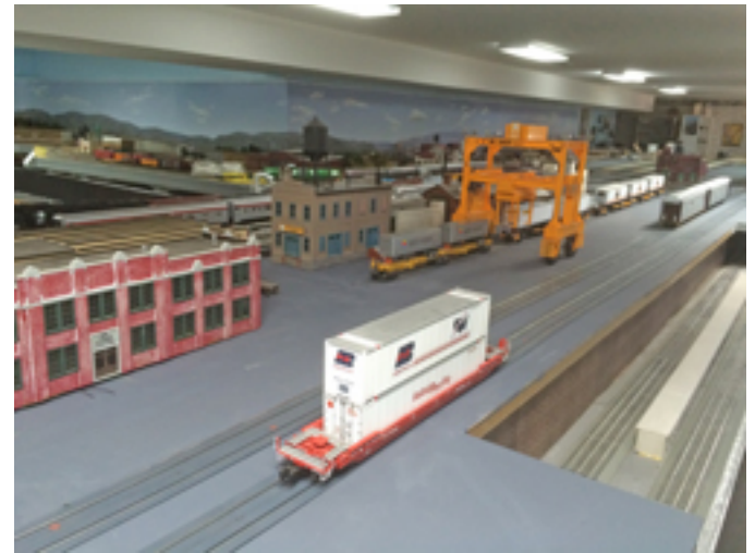
The intermodal yard