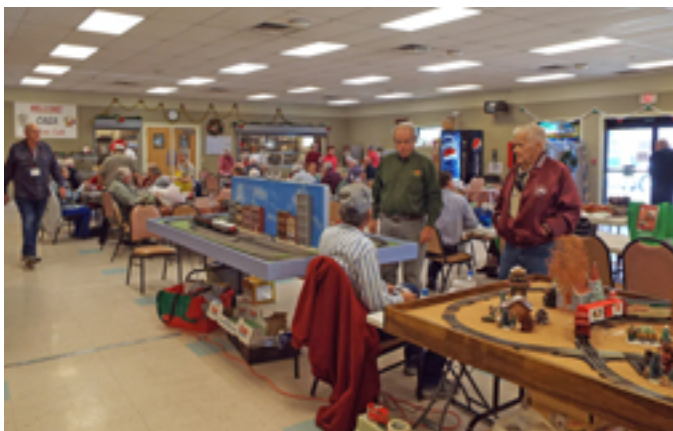
At the Prescott Valley Senior Center