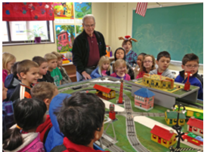
At Del Rio Elementary School

Here is the neat part. Other than it must be O gauge tinplate, each member was free to choose his own track design and scenic theme. Other than track and wiring, all buildings and scenery must be portable, but that is not a problem. Some fellows just box their items up. I bought a small plastic chest of drawers on rollers to store my items and whose top is used to set my ZW on while operating.