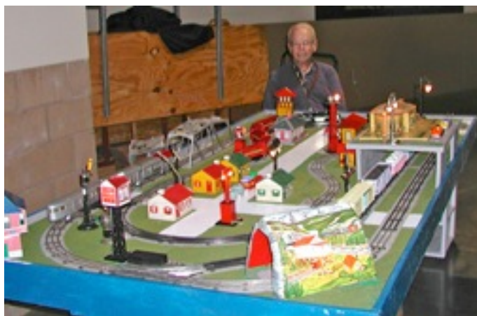
My layout has a '50s tin theme

(And since my layout was still in my pickup last December when the Desert Division, TCA, put out a call for someone to bring a layout to former Attorney General, Terry Goddard's annual neighborhood Christmas party, I was able to run trains all afternoon in his back yard!)