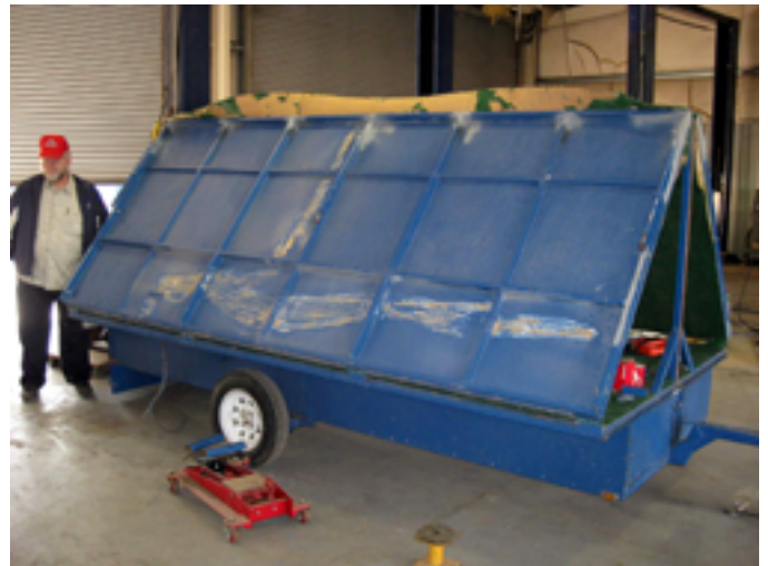
The beginning, sides are cut down for a lower profile

When done, it will have a new, lowered profile to fit into doors easier, new wiring, a new sign and a complete repaint job.