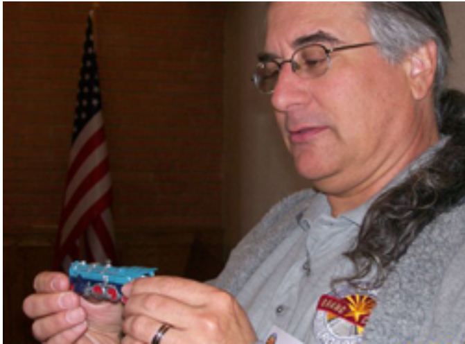
Well, maybe it will not quite fit on Standard Gauge track!