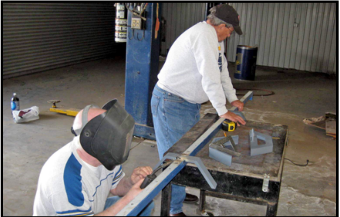
The GCMR layout trailer is undergoing a major renovation and upgrade. See more of this project inside.