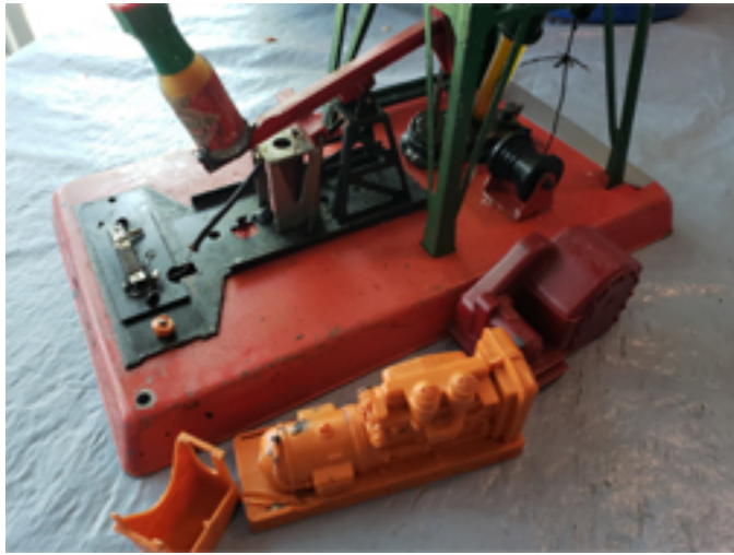
Here is that oil derrick base that needs help