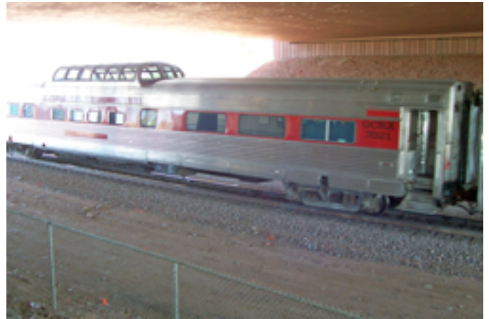
And one of Dave's Cumbres and Toltec photos

thing about the engine picture, this was taken before the light rail bridge was built, so this kind of picture can't be taken anymore.