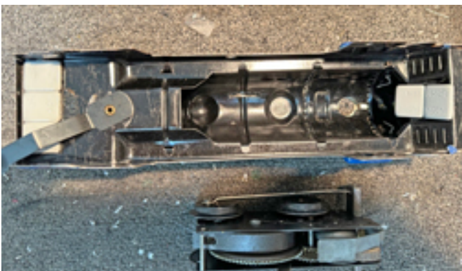
the weights added