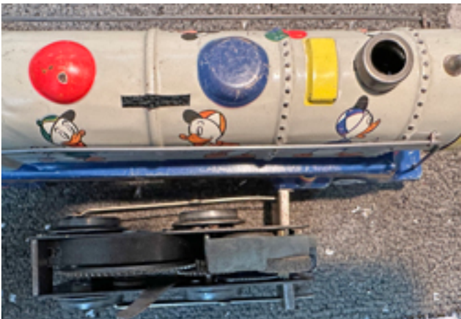
the sparkler in relation to the smoke stack