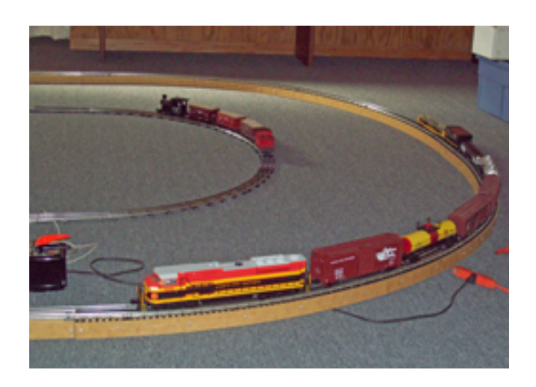
Running trains at the meet